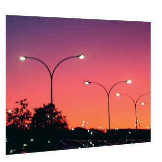
THE ENERGY INDUSTRY